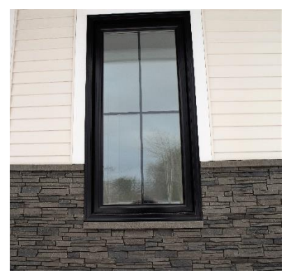
Triple Glazed Casement Windows