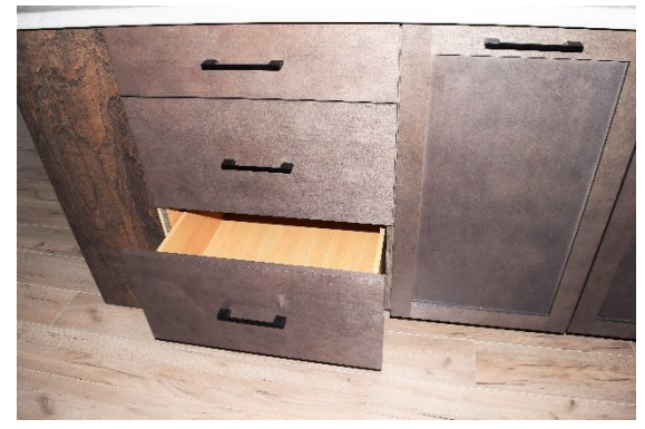
Self Closing Drawers