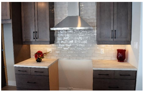
Under Cabinet Lighting