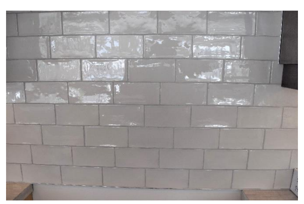
Lovely Back Splash