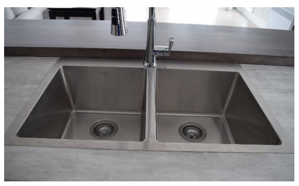
Deep Stainless Sink