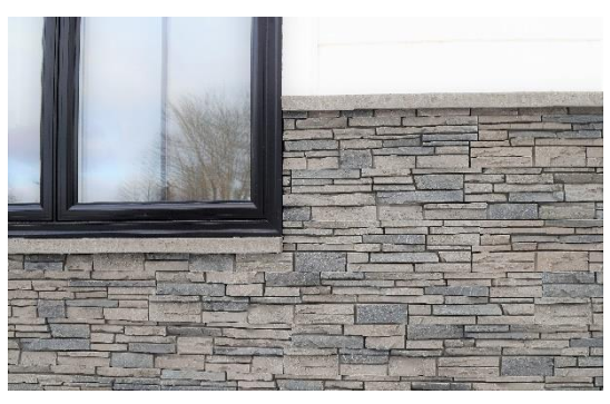
Exceptional Attention to Detail