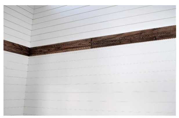
Ship Lap with Wood Accents