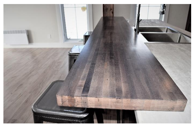
Butcher Block Bar Top