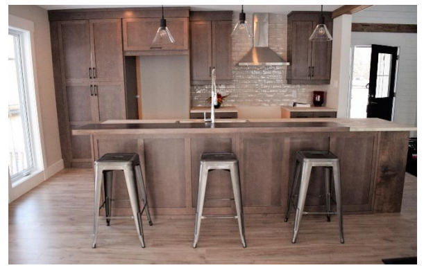
Perfect Space for Entertaining