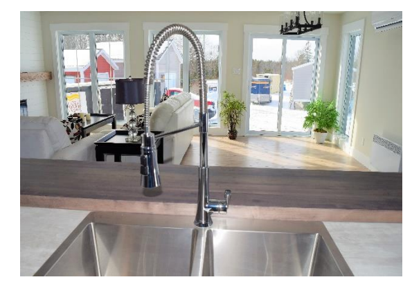
Bright & Inviting