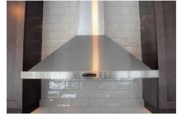
Ven Mar Range Hood