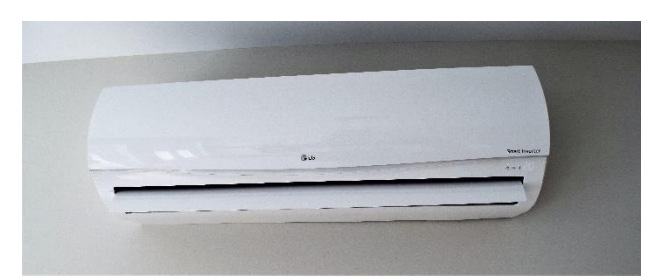
18,000 BTU Heat Pump