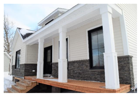
Lovely Covered Entry