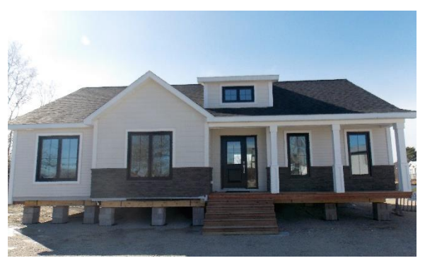
Wonderful Curb Appeal